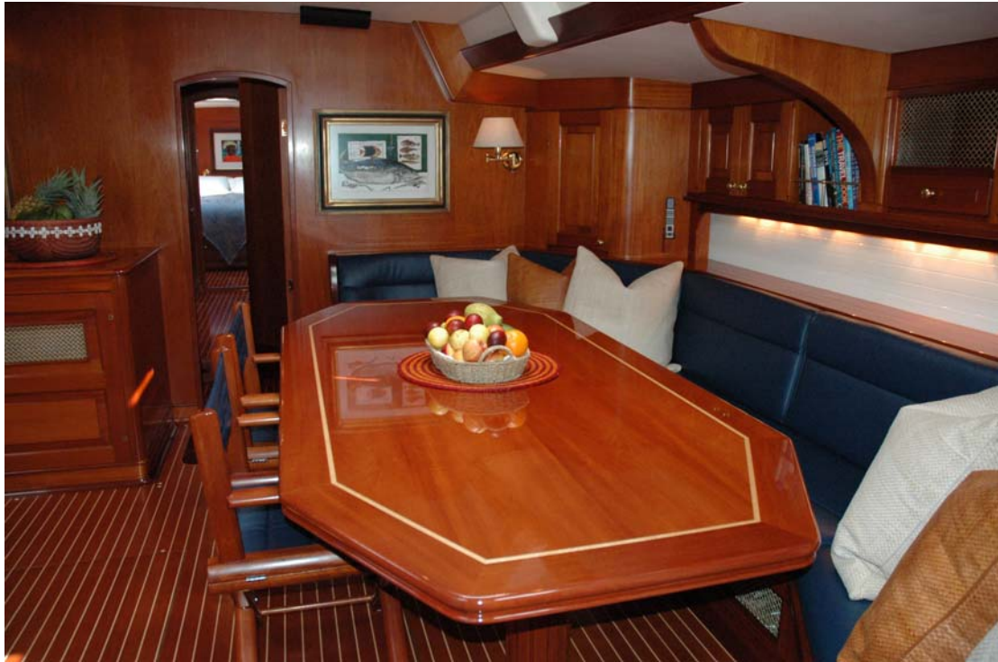
Above and below: A view forward showing starboard side salon dining area. (Additional directors chair not shown.)

On going below via the main companionway, the salon has two seating areas. To starboard there is a large formal dining table with ample seating for eight. To port is a cosy sofa and coffee table. Ahead in the centre is a cabinet with a retractable, flat screen TV, which can rotate to suit either seating area. The finish is mahogany joinery with white panelling and teak and holly traditionally styled floorboards.