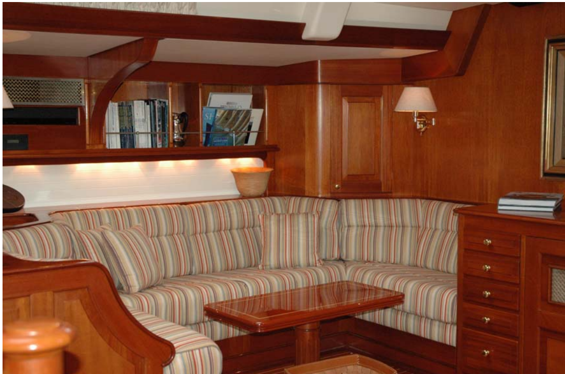
Just out of shot to the left is a stewardess counter/bar area that also houses all guest crockery and glassware in fitted cabinets. This area allows the crew to remain available without encroaching on guest areas.