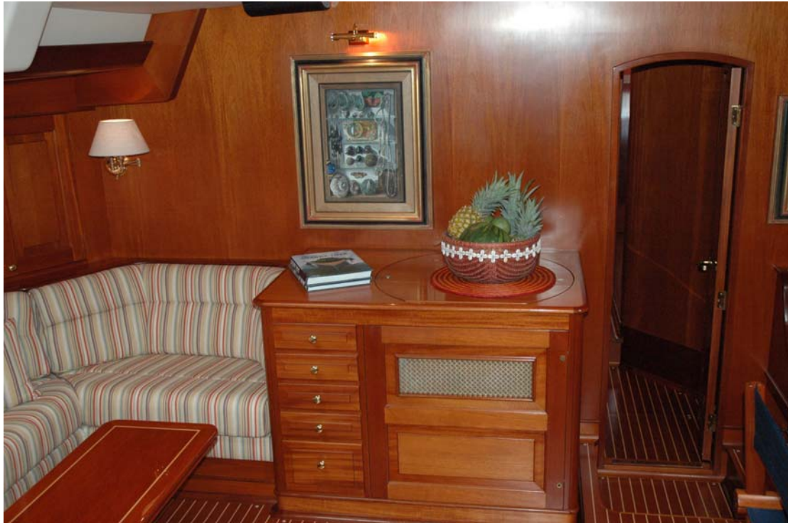
Above and below: A view forward in the salon showing access to the guest accommodation. (The cabinet houses the flat screen Bang & Olufsen TV installed October 2005.) To port is a sofa and coffee table area that seats four comfortably.